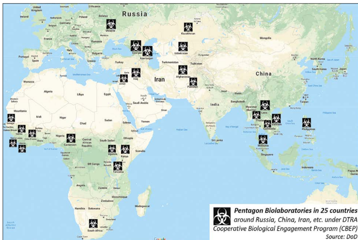
Figure 1 – Location of American biological laboratories outside the national territory. There are two groups of them. The first covers China, Iran, Turkey, Russia, Belarus. The second is located in sub-Saharan Africa and South Africa, i.e. where the most dangerous pathogens of a viral and bacterial nature are widespread and where their study seems justified. The scheme is taken from the site: https://112.international/society/us-biolaboratories-in-ukraine-how-dangerous-are-they-for-population-54975.html (date: 31.12.2021)

the U.S. Department of Defense's biosafety and biosurveillance programs, as well as the presence in the post-Soviet space, including the territory of Moldavia, of biological laboratories that not only conduct «peaceful research and development of vaccines,» but also store dangerous pathogens and threatening pathogens. Although officially they are talking about scientific projects and countering the threat of outbreaks (including deliberate and accidental) of the most dangerous infectious diseases in the world, it seems that the activities of these biological laboratories in Moldavia are, as mentioned above, a secret behind seven seals, including for the national authorities. In total, about $ 4 million was allocated to Moldavia for scientific projects of various orientations, but where the main amounts go remains «behind the scenes». The history of cooperation between the Moldavian authorities and the STCU dates back to the year 2003, when it was decided to join the Agreement on the Establishment of the STCU. In December 2003, the Parliament adopted Law No. 531 on the accession of the Republic of Moldavia to the Agreement on the Establishment of the Scientific and Technological Center. After the law came into